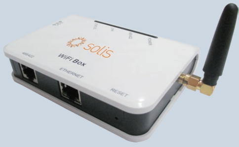
Data Logging Box DLB